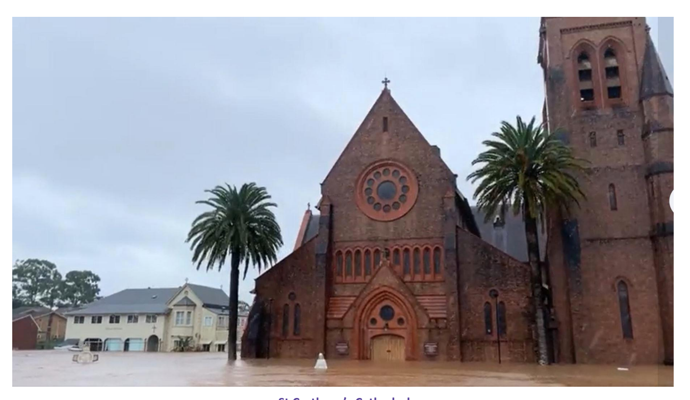
St Carthage's Cathedral.

While the physical damage is huge the human cost of this event is going to be long lasting and far for difficult to 'fix'. Buildings can be rebuilt but the human psyche and soul are far harder to put back together. Please pray for the people of Lismore and surrounds. The town and our community have a very long road ahead.