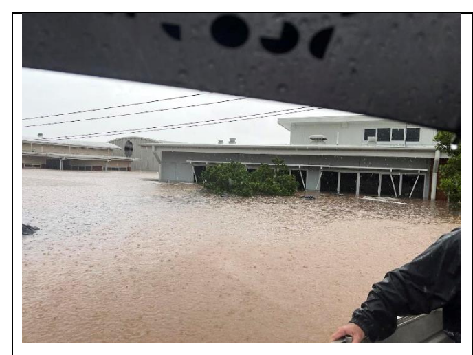
The new TAS building only completed two years ago. The flood of this building is 12.5m above normal river level.