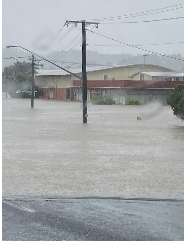
The corner of Hindmarsh and Leycester Streets. There is actually a statue of Chamagnat hidden beneath the water on this corner.