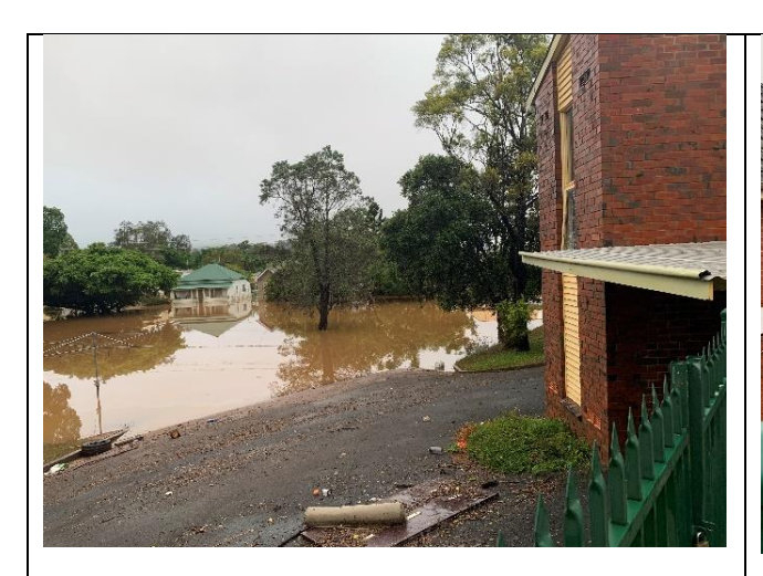
Debris at the carport entry of the Brothers' House