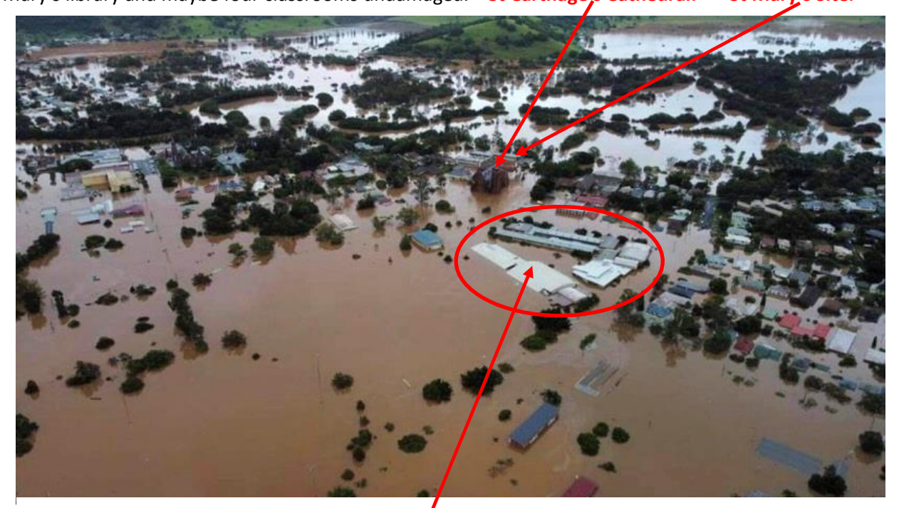
Trinity Catholic College (St Joseph's Site) is to the right of the ovals.

The College has been 'smashed'. Every building and room on the St Joseph's Site has been flooded, even the first floor. We are unsure of the damage on the St Mary's Site, but it looks like the entire ground floor and the Admin Block level have gone under. Put simply, if our worst fears come to pass, we will have the St Mary's library and maybe four classrooms undamaged. St Carthage's Cathedral.