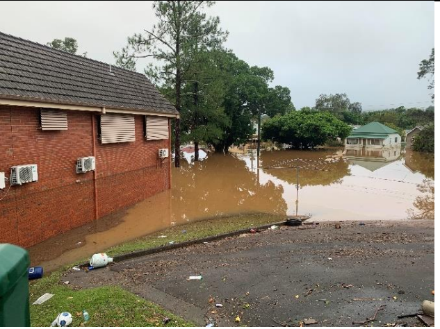
The flood level line on the side of the presbytery.