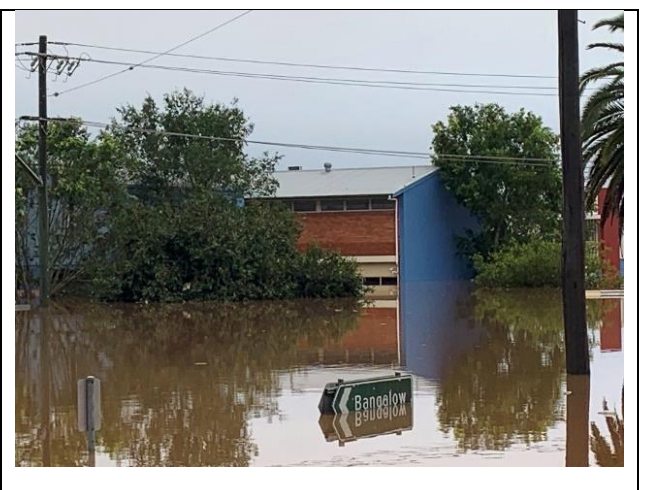
You can see the peak water level line on this building. This is on the first floor of the St Joseph's Site.