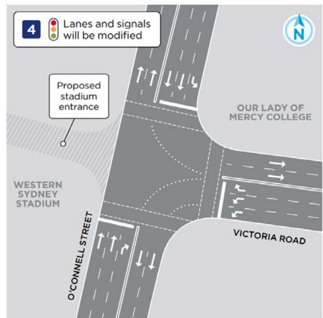
Figure 1 Proposed intersection layout

This work may require a temporary disruption to some services. The relevant utility providers will notify you in advance should this occur.