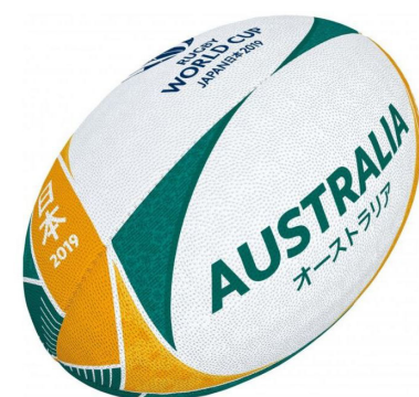
Above: Plenty of World Cup watching during the holidays I'm sure.