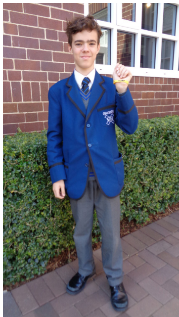
Above: Harry Browne